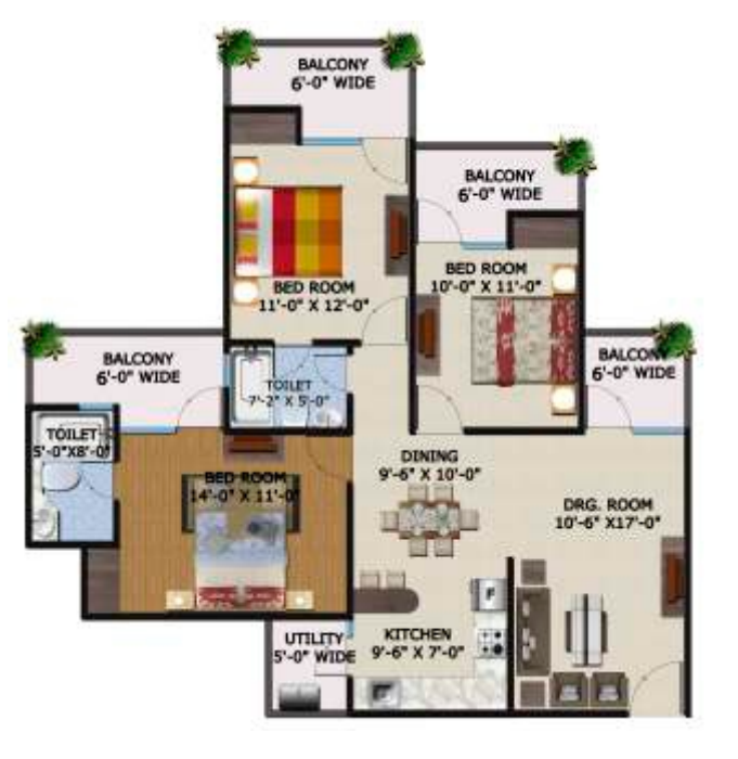
Area- 1545 Sq. Ft. 3 Bedroom. 2 Toilet. Kitchen. Dining. Drawing. 4 Balconies.