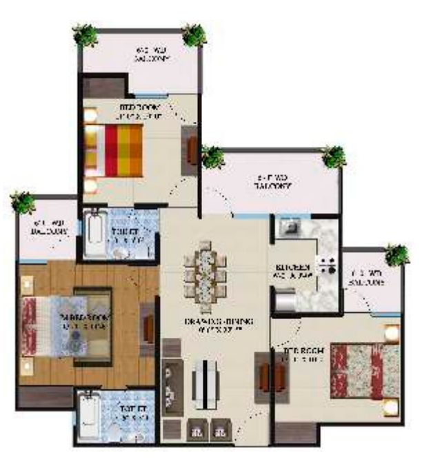
Area- 1375 Sq. Ft. 3 Bedroom. 2 Toilet. Kitchen. Dining. Drawing. 4 Balconies.