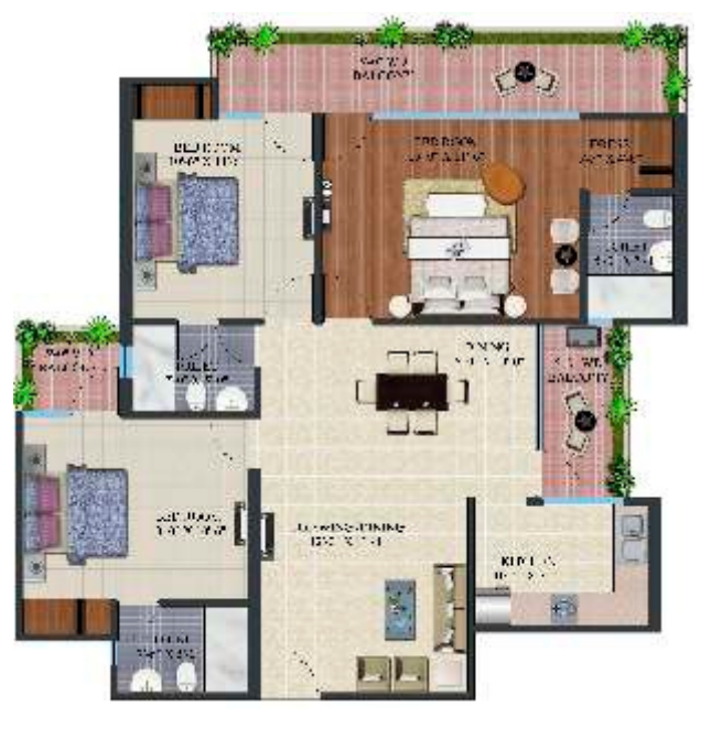
Area- 1660 Sq. Ft. 3 Bedroom. Dressing Room. 3 Toilet. Kitchen. Dining. Drawing. 3 Balconies.