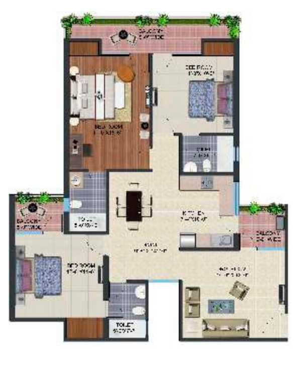
Area- 1660 Sq. Ft. 3 Bedroom. Dressing Room. 3 Toilet. Kitchen. Dining Drawing. 3 Balconies.